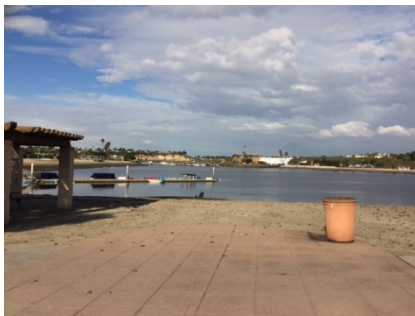
On the Bay at Newport Dunes